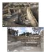
Figure 2. The harbour town Gibala-Tell Tweini and the Sea People destruction layer.

town of the Ugarit kingdom. The destruction layer contains remains of conflicts (bronze arrowheads scattered around the town, fallen walls, burnt houses), ash from the conflagration of houses, and chronologically well-constrained ceramic assemblages fragmented by the collapse of the town. This stratified radiocarbon-based archaeology, with anchor points in ancient epigraphic-literary sources, Hittite-Levantine-Egyptian kings and astronomical observations, was used to precisely date the Sea People invasion in northern Levant, a decisive episode in a long-term collapse of the ancient Eastern Mediterranean world. By confronting historical and science-based archaeology, the data offer the first firm chronology for this key period in human society.