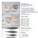
Figure 3. Gibala, Ugarit Kingdom: bronze arrowheads and typical ceramic assemblage for the end of the Late Bronze Age and the Sea People event in the Aegean and Eastern Mediterranean.

Ceramics and arrowheads were retrieved from the destruction Level 7A. The ^{14}\text{C} weighted average value and calibrations provide a robust chronological framework for the Sea People event.