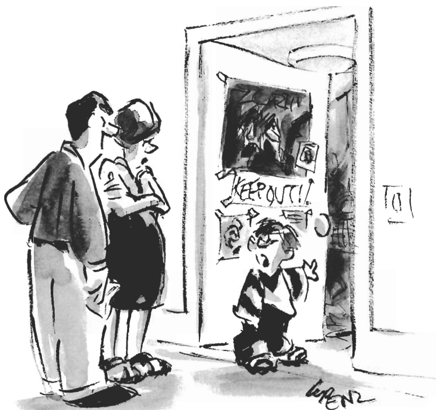
"Freedom's on the march everywhere but 114 Circle Drive."

After the lecture, I walked with Weiss back to his office, which is near the center of the Yale campus, in the Hall of